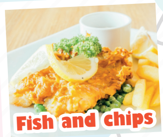
Fish and chips

In 1800's, the English people were eating fish and chips in the streets in old newspapers, because it was popular for poor people and workers. Today everybody prefers eating fish and chips in the streets than going to the restaurants or they can go to the small local fish and chips cafes.