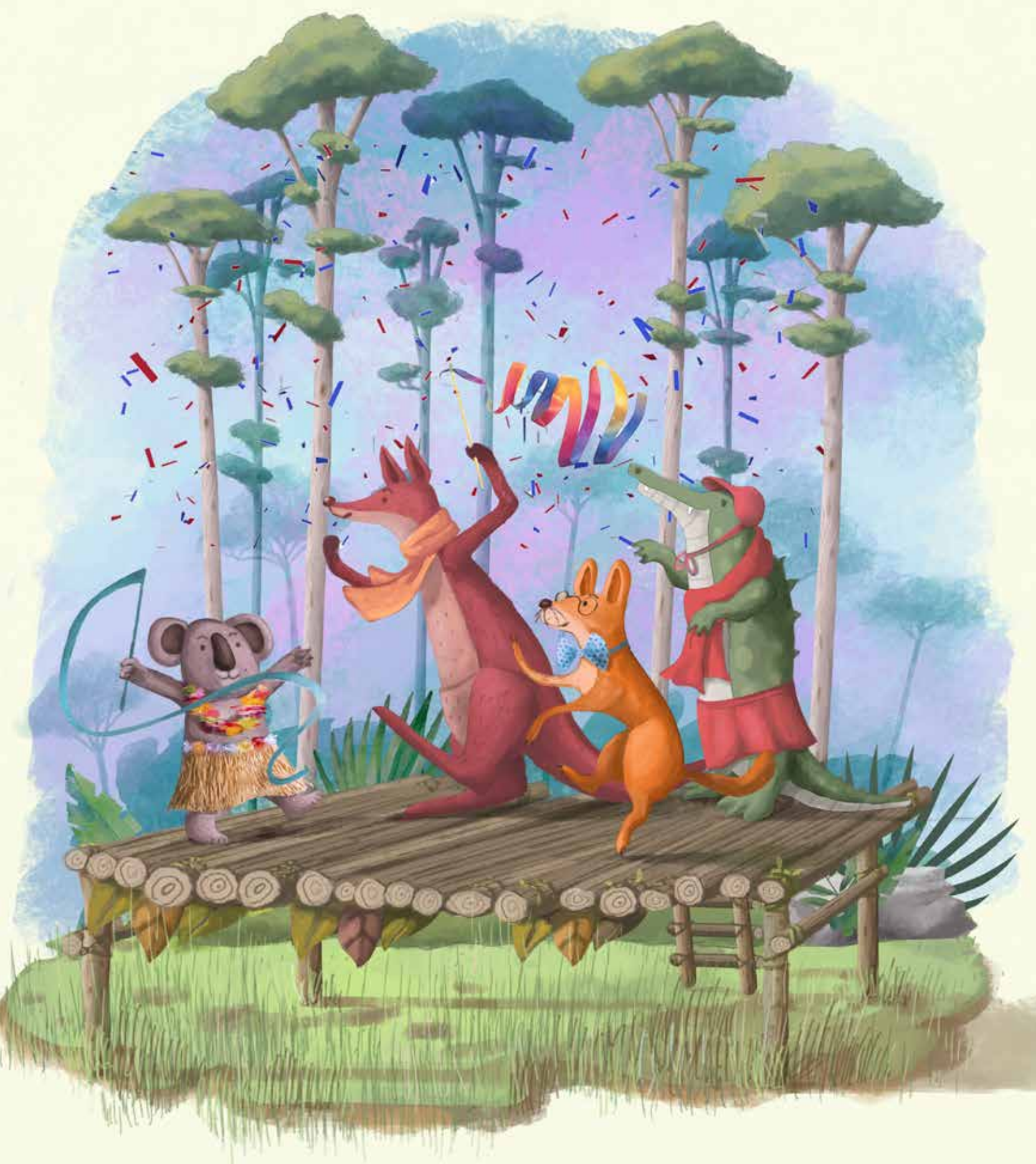
All the animals gathered around Red Kangaroo and they danced together until dark.